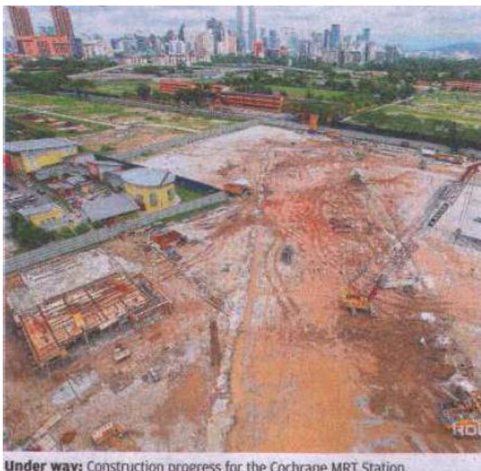
Under way: Construction progress for the Cochrane MRT Station.